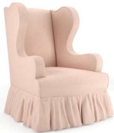
THE CLEMENTINE WING CHAIR H 1080mm x W 740mm x L 690mm COM 9.5m