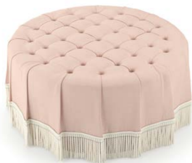
THE AMELIA OTTOMAN H 400mm x Diam 900mm COM Top 3m, Underskirt 2m, Drum 2m, Trim 5m