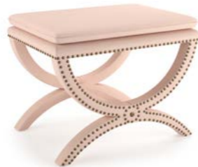
THE CARLA STOOL H 500mm x W 600mm x L 430mm Both Stools COM 2.5m