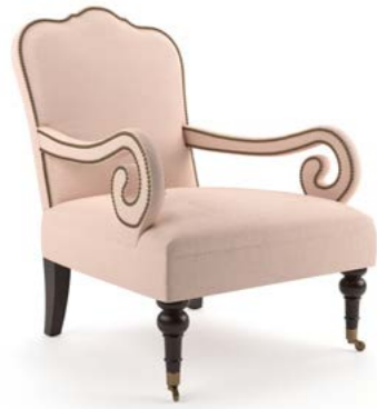
THE MONTAGUE CHAIR H 939mm x W 686mm x L 889mm COM 4.5m