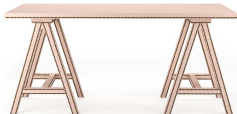
THE MATILDA TRESTLE L 1700mm x W 850mm x H 800mm COM 6m or 2 hides