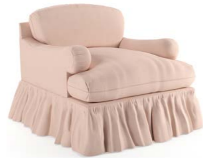
THE LUCIA CHAIR D 950mm x W 880mm x H 700mm COM 12.5m