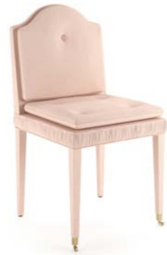
THE GRACIE CHAIR OAH: 880mm x W 500mm x SD 545 x SH 450mm COM 3.5m