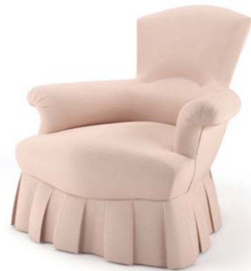
THE SHEENA SALON CHAIR OAH 840mm x W 830mm x D 700mm SD 600mm x SH 320mm COM 8m