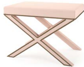
THE ALEXANDER STOOL L 430mm x W 620mm x H 470mm